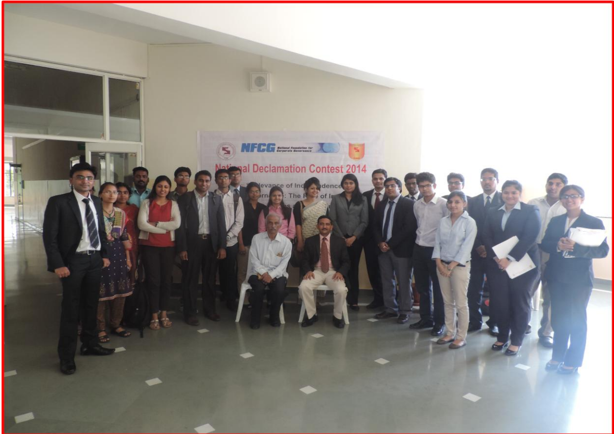
Contestants with panel members outside of Conference Room