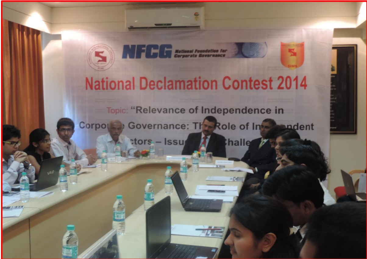
Banner of Declamation Contest inside the Conference Room